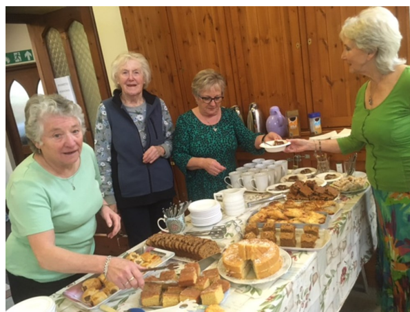
Tuesday Tunes Helpers

We have many other activities – please see our website – felixstowe.methodistic.org.uk – for the full list.