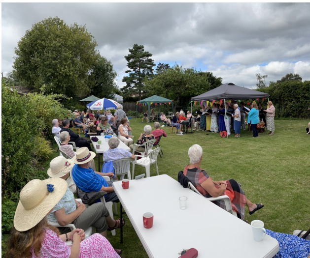
Kirton Garden Cafe

F elixstowe Methodist Church – the new name for the four churches at Kirton, Seaton Road, Trimley and Trinity – has much to celebrate.