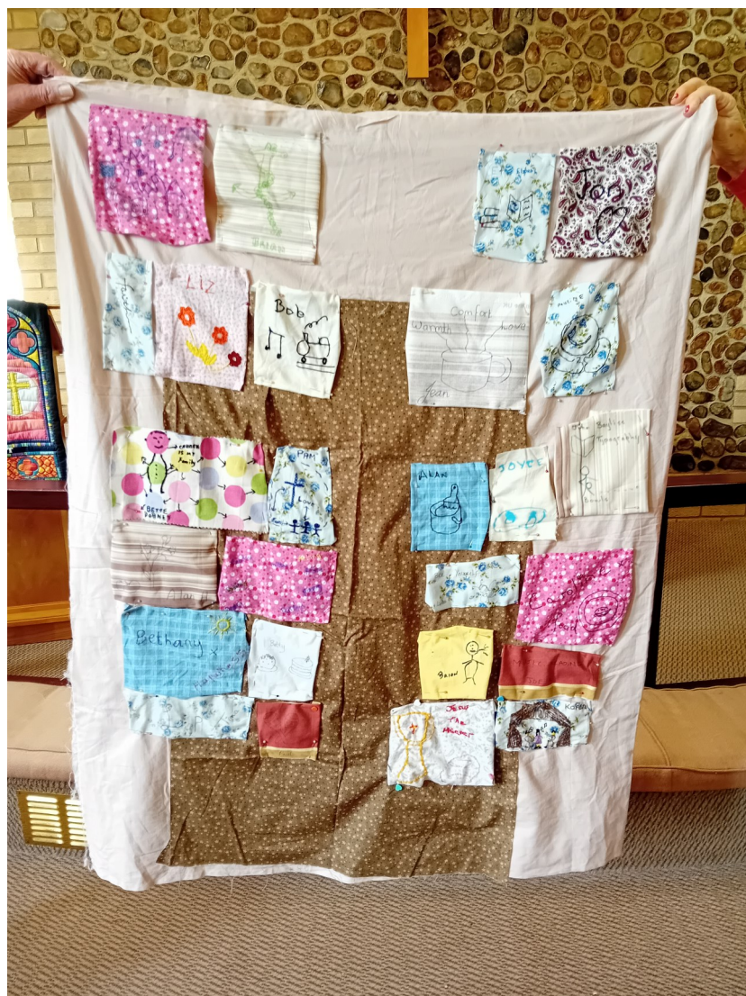
Photo from a Church life stitching project at the Kessingland Methodist Church, where people were given a piece of fabric and asked to write their names and draw something that depicted what they bring to the church or is very important to them. These were stitched over and made up into one piece of work.

Revd Pam Bayliss Lowestoft and East Suffolk Circuit