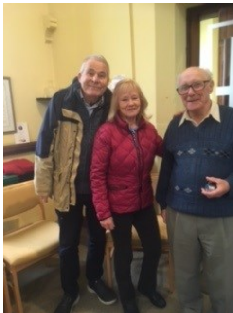
Tuesday Tunes Helpers

invited to give a donation towards church funds and the local Basic Life Charity. After thirty sessions, over £6,000 has been donated which has been split 50/50 between the church and Basic Life Charity. Each week a band of willing volunteers make cakes, serve refreshments and give a warm welcome to all attending. People are so grateful for the