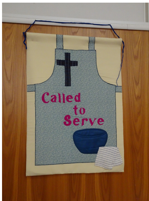
Banner from Louth (Lincolnshire) Methodist Church advertising service

At the Autumn Representative Synod we broke into small groups to consider these. In this article I would like to celebrate what is already being done by the Churches across our District. This probably only reflects a small part of what is actually being done. Let us “celebrate” and say thanks for: