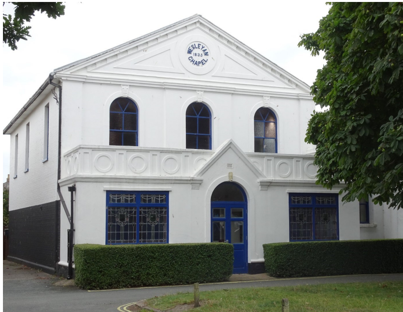
Before Worship ceased

helper. We were given a supply of food from Lowestoft Foodbank's warehouse and no one came for the first two weeks. We now have 8 volunteers and we are never alone - and we get through a lot of food.