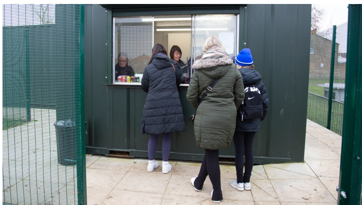
Trimley Red Devils serving baps to spectators

Every Saturday in all weathers, during the football season, a group of willing volunteers from the church support the Trimley Red Devils by serving bacon and sausage baps to the spectators. This is hugely appreciated with lots of conversations while serving.