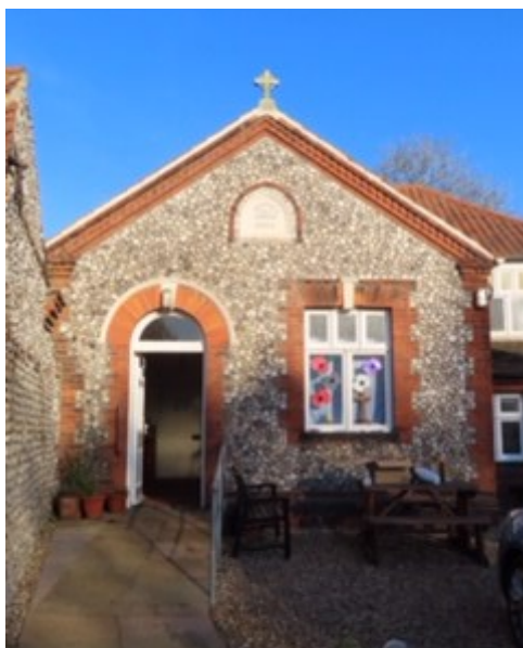
Pilgrim Methodist Church, Blakeney

A small congregation gathered socially distanced in The Pilgrim Methodist Church Blakeney. The theme “Love came down at Christmas”. At the end of the service little goodie bags were handed out each containing heart Christmas tree decorations, chocolates, bookmarks to colour, a Christmas nativity silhouette with the words “Love came down at Christmas” and a Christmas card saying, ‘With Love from the Pilgrim Methodist Church, Blakeney’ .